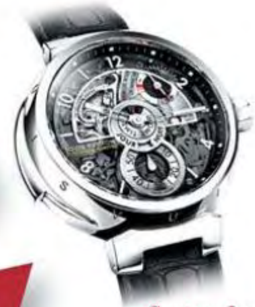
Custom Louis Vuitton Tambour Minute Repeater