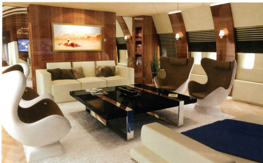
A FUTURISTIC-LOOKING BOEING 747 INTERIOR BY EDESE DORET INDUSTRIAL DESIGN CONVEYS THE REALITY OF LUXURY AND SPACIOUSNESS.