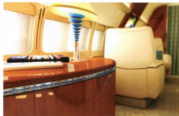
THIS BBJ2'S DISTINCTIVE CABINETRY AND LIGHTING ARE THE WORK OF RWR DESIGNS, A COMPANY THAT SPECIALIZES IN AIRCRAFT, YACHTS AND INTERIOR ACCESSORIES.

"Typically, there's never enough space," said New York