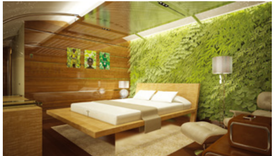
Edése Doret's 'living wall', set for delivery in a 787-9 in 2015