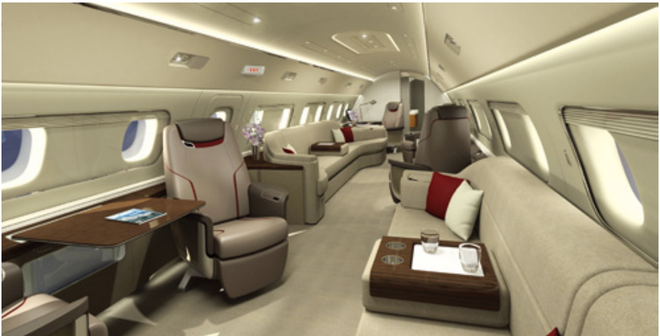
| Embraer Lineage 1000 cabin

“The home/office in the sky is vital in today's fast-paced business world...”