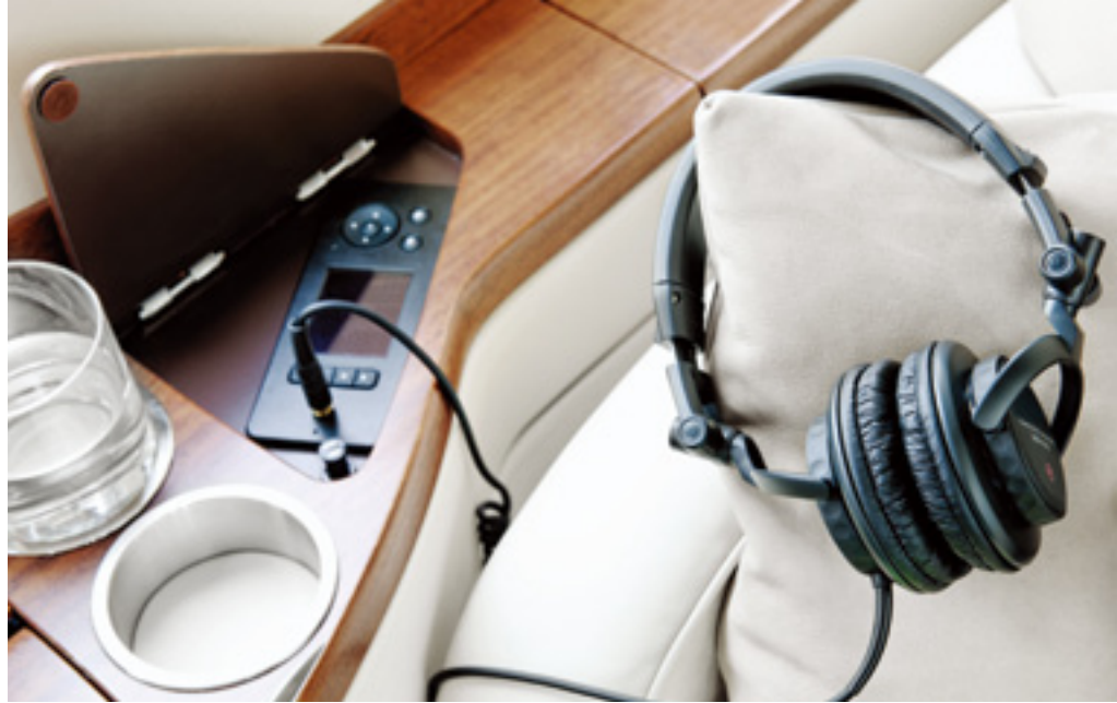
Dassault creates its own interiors in Little Rock, Arkansas

auxiliary fuel system that extends the range of the aircraft to approximately 3,000nm. This is now installed as standard.